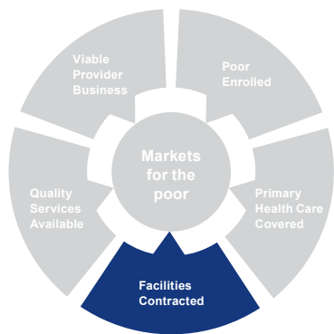
Figure 2: Tunza Platinum Business Model