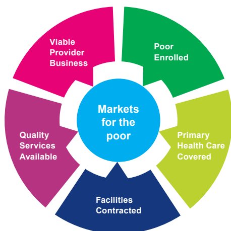
Figure 1: AHME conceptual framework